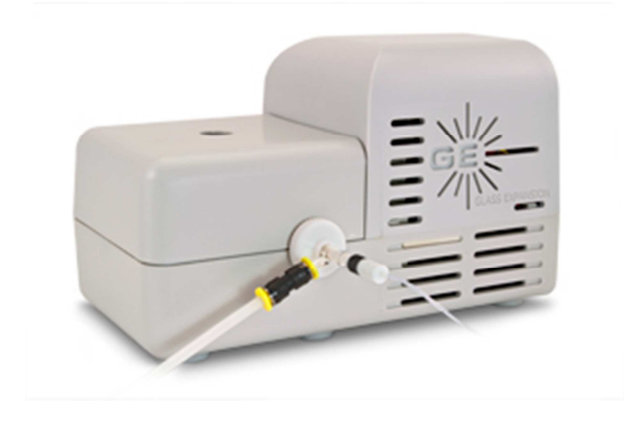
Figure 1. IsoMist

The IsoMist Programmable Temperature Spray Chamber, provides the benefits of a temperature-controlled ICP sample introduction system in a compact, convenient package.