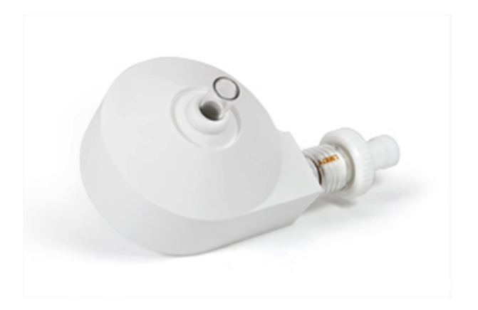
Figure 6. Encapsulated Twister Spray Chamber

The IsoMist incorporates the proven Twister cyclonic spray chamber, combining excellent sensitivity and precision with exceptionally fast washout. The Helix nebulizer interface has zero dead volume and provides for convenient nebulizer insertion and removal. This system is compatible with the full range of Glass Expansion nebulizers.