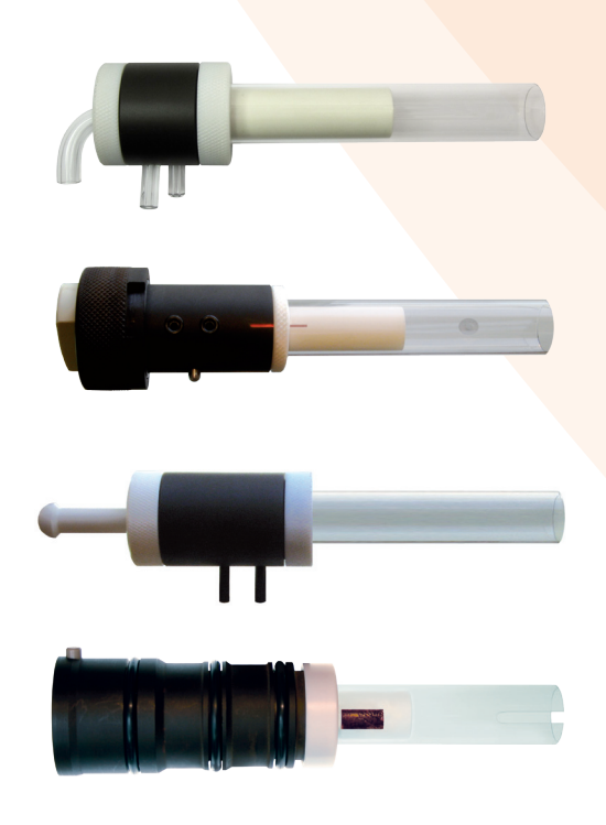
The D-Torch is available for a range of ICP models, including those from PerkinElmer, Spectro, Thermo and Varian. Please contact us for details.

The D-Torch is performing very well. The ceramic outer has been in almost constant service 22 hours a day, 6 days a week since we purchased it and we have had no issues...We are due to purchase a replacement ICP and will certainly be purchasing another D-Torch to go along with it.